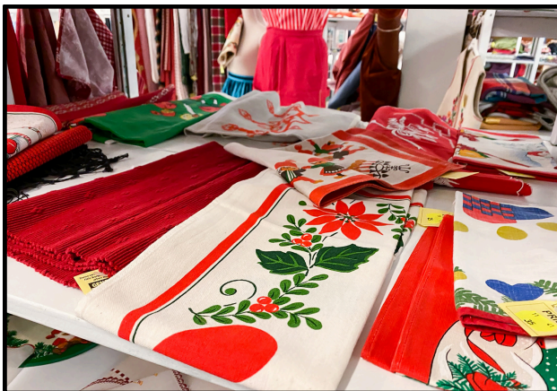
Donating Christmas decor to local thrift stores is a great way to reduce waste during the holidays.

Consider upcycling old decorations into new items or donating them to thrift stores or community organizations. This reduces the need for new raw materials and extends the life of these items.